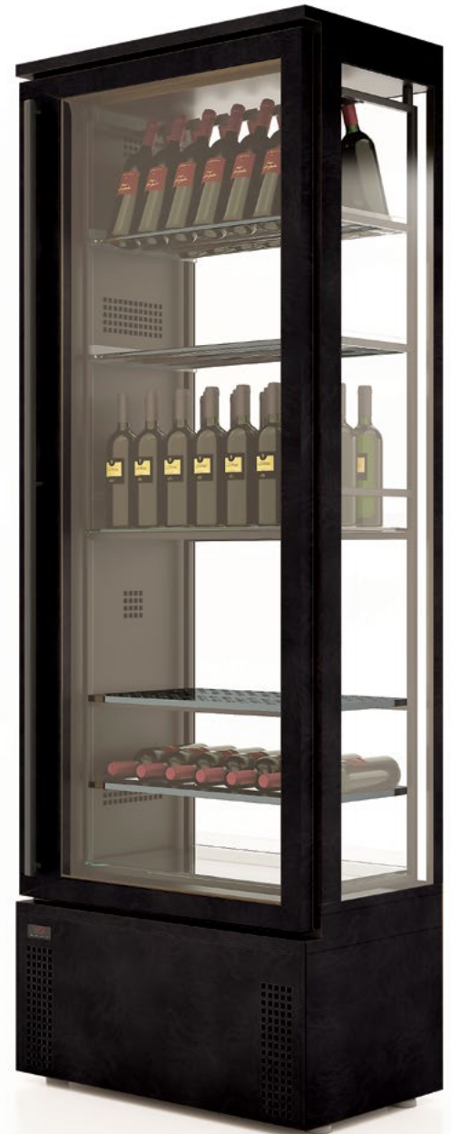
DECANTER Model 8980210 in Black finish

Decanter design and elegance offer a great visibility to the displayed product. Its compact size makes it adaptable to any space needs and, together with its different customized solutions, it becomes a refined piece of furniture and stands out in the location where it is positioned: from the wine shop to the restaurant, from the bar to the private residence.